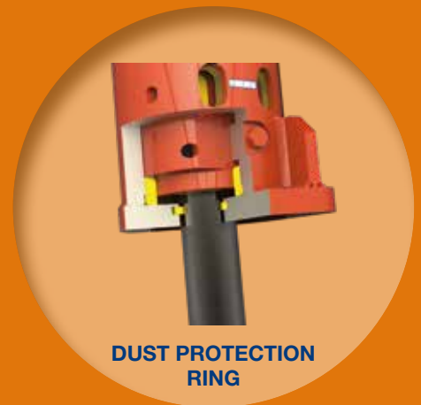
DUST PROTECTION RING